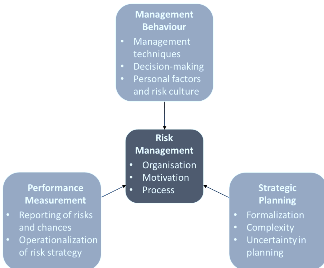
Figure 2. Research framework on the basis of a recent literature review