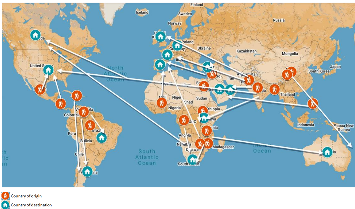
Figure 3. Contemporary directions of climate migration